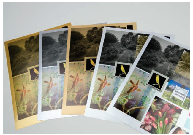
Simply Elegant ^{\rm tm} Metallic Inkjet papers. (Left to Right) Pure Gold, Pure Silver, Moonglow, Chrome and Pearl.

Inkjet Station Silver Metallic and Simply Elegant Pure Silver appear to be a similar if not the same product,