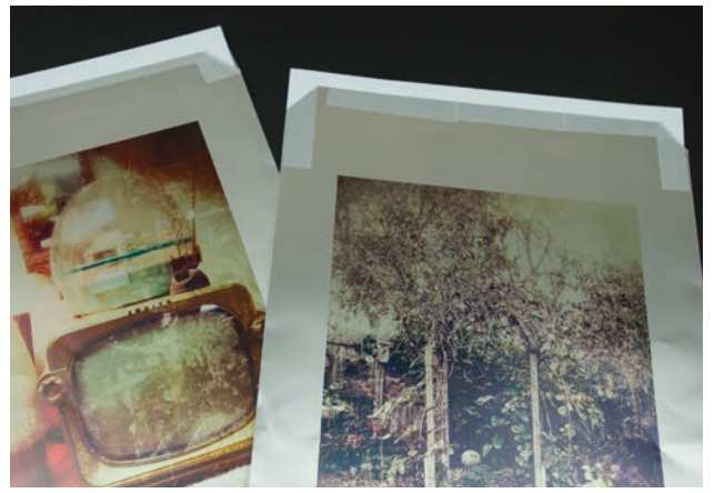
Printed blank offset plates showing leader paper attached.

A friend gave me a few uncoated aluminum offset printer plates. These are called 'blanks' in the printing trade. There is no chemical coating on them so they are perfect to use with InkAID. I taped a sheet of inkjet paper to the bottom of the sheets to act as a leader and fed it into the printer using the rear slot. They worked very well. Finally my favorite, Reynolds Wrap! I think I love this the most because of all its imperfections. It's a little difficult to coat and if your work surface