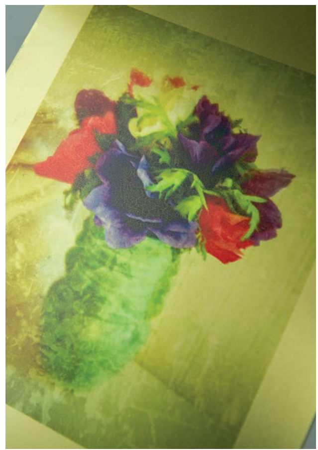
Print made on double coated brass sheet.

portant to make sure you have good coverage when coating the plates. Rubbing the metal with extra fine steel wool before coating might also help coating adhesion. These loaded fine in the front loader on my printer.