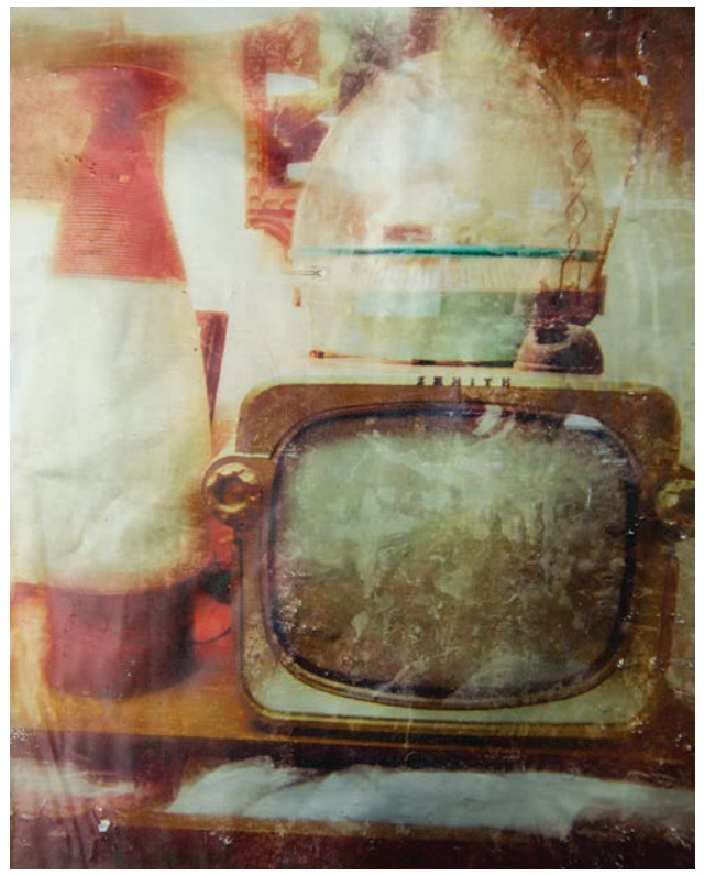
Print made on coated Reynolds Wrap aluminum foil. Tiny imperfections add to the handmade look of this delicate print.