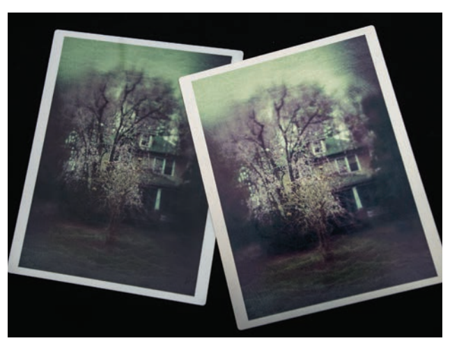
Two ChromaLuxe prints, Gloss white metal on the left, Matte clear aluminum on the right. The texture seen is in the image, not on the aluminum plates.

Most modern labs making metal prints use the ChromaLuxe brand dye sub process and materials. ChromaLuxe labs offer four types of metal prints, Gloss White, Gloss Clear, Matte White, Matte Clear. You can find the lab closest to your studio using the 'lab finder' feature on the ChromaLuxe website.