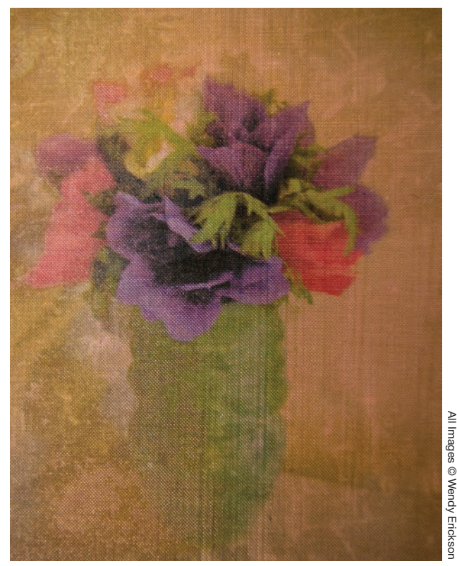
Print on double coated copper mesh.

Labs: Booksmart Studio-booksmartstudio.com; ChromaLuxe -chromaluxe.com; Copper wire mesh: amaco.com; Coatings: inkAID-inkaid.com; Papers: Inkjet Station-inkjetstation.com; Simply Elegant-itsupplies.com; K&S Engineering-ksmetals. com; Moab Slickrock Metallic Silver 260-moabpaper.com; Reynolds Wrap-your local supermarket