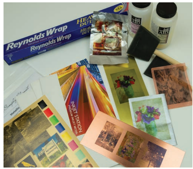
Some of the materials used to make metal and metallic prints.

Use more than one coating. Let the first coat dry overnight, and give it a second coat the next day. To