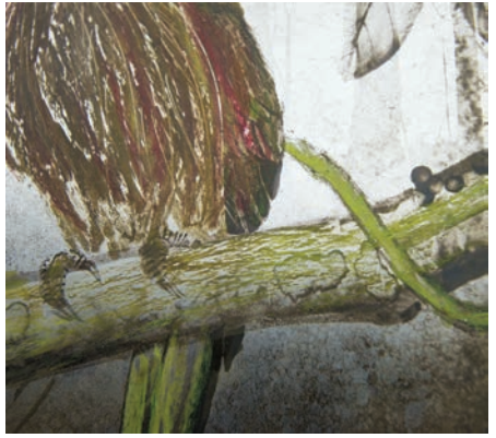
Detail of oil pastel applied to print made on blank offset printing plate.

Think about how it might work for you, from brilliant glossy commercially made display prints, to delicate handmade prints on aluminum foil. Metal has an edge to it, no matter how you look at it.